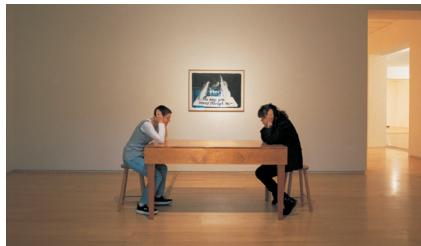
→ Laurie Anderson, The Handphone Table – When you we're hear, 1978. Collection du mac LYON