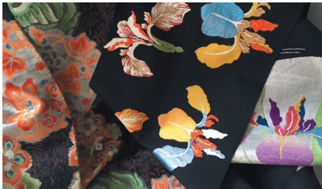
→ Lee Mingwei, Bedtime Stories, 2017.