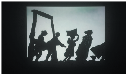
→ William Kentridge, Shadow Procession (detail), 1999. Collection FNAC, at mac LYON