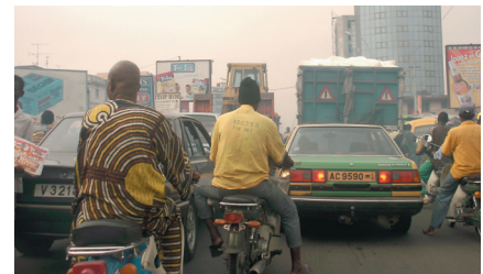
→ Cotonou (Bénin), 2005

The exhibition tells a story about the convergence of cultures and distinct zones, through the juxtaposition of works from the mac LYON and the Musée Africain, the artworks of the artist, Massinissa Selmani.